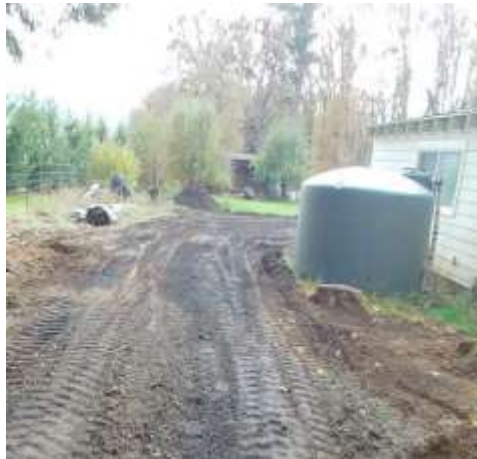
Inspector Mike looking over waterline and backfilled trench.