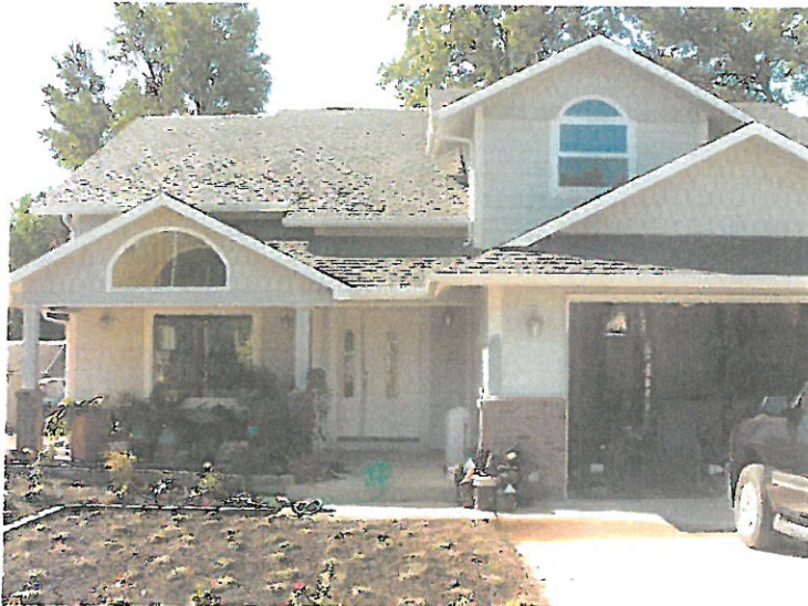
FRONT VIEW 8/25/06