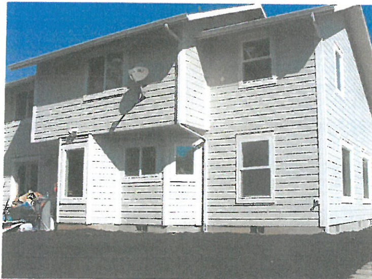
REAR VIEW 8/25/06