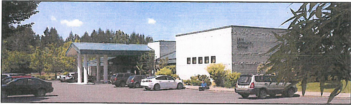
Lane Community College-Cottage Grove is the proposed site of a new Community Health Center of Lane County.