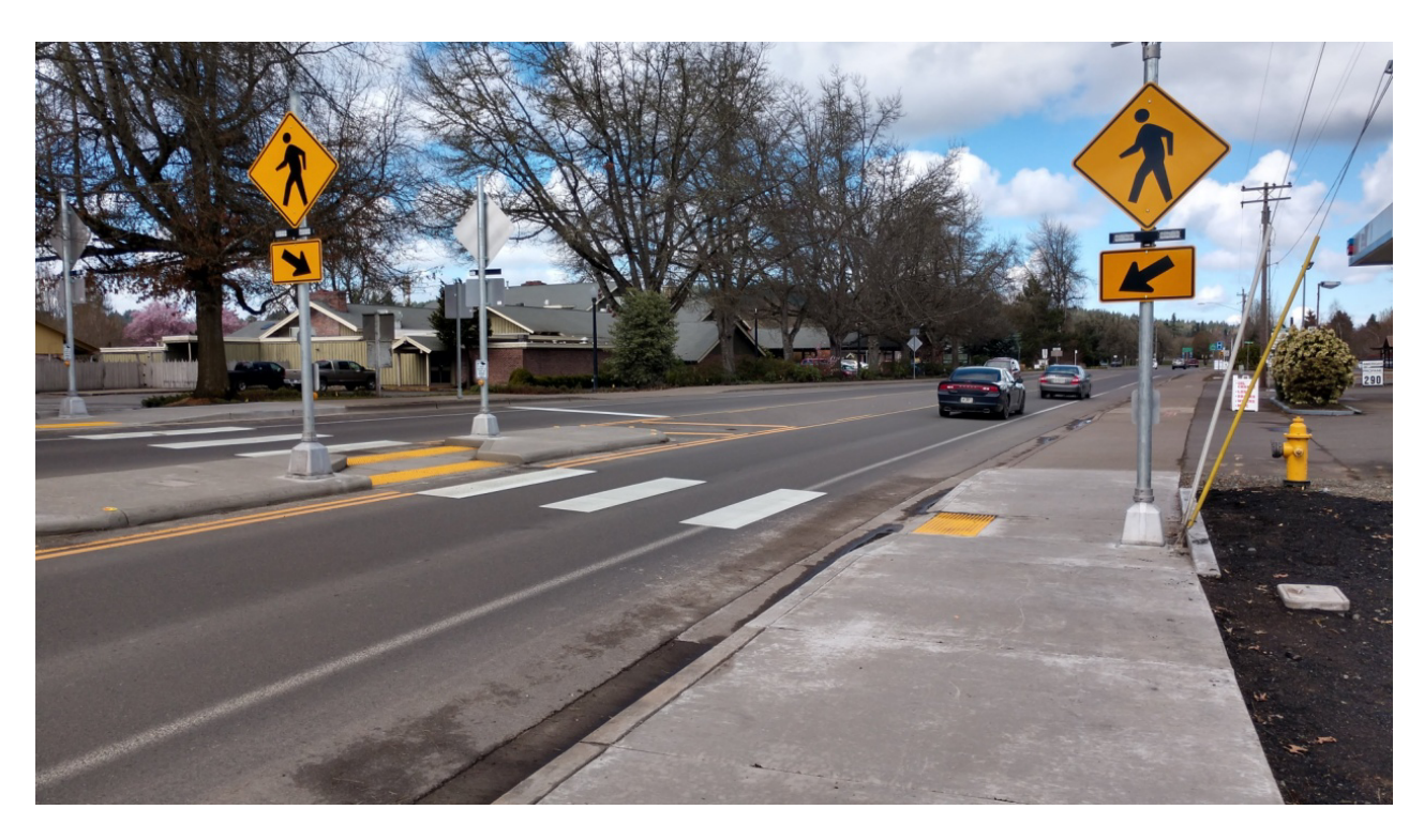
Row River Road – New Pedestrian Crossing