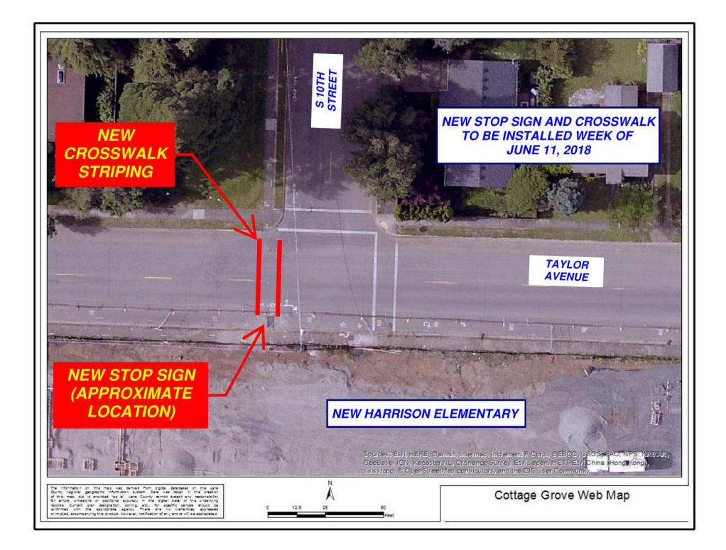
Drivers: The safety of our community's children is in your hands.

A new crosswalk will also be added on the west side of this intersection with accessible pedestrian ramps.