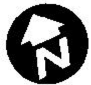
Figure 14 Culp Creek Well Location Map City of Cottage Grove Water Supply Feasibility Study